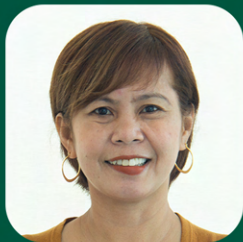
LOTUS POSTRADO BA Sociology 1995