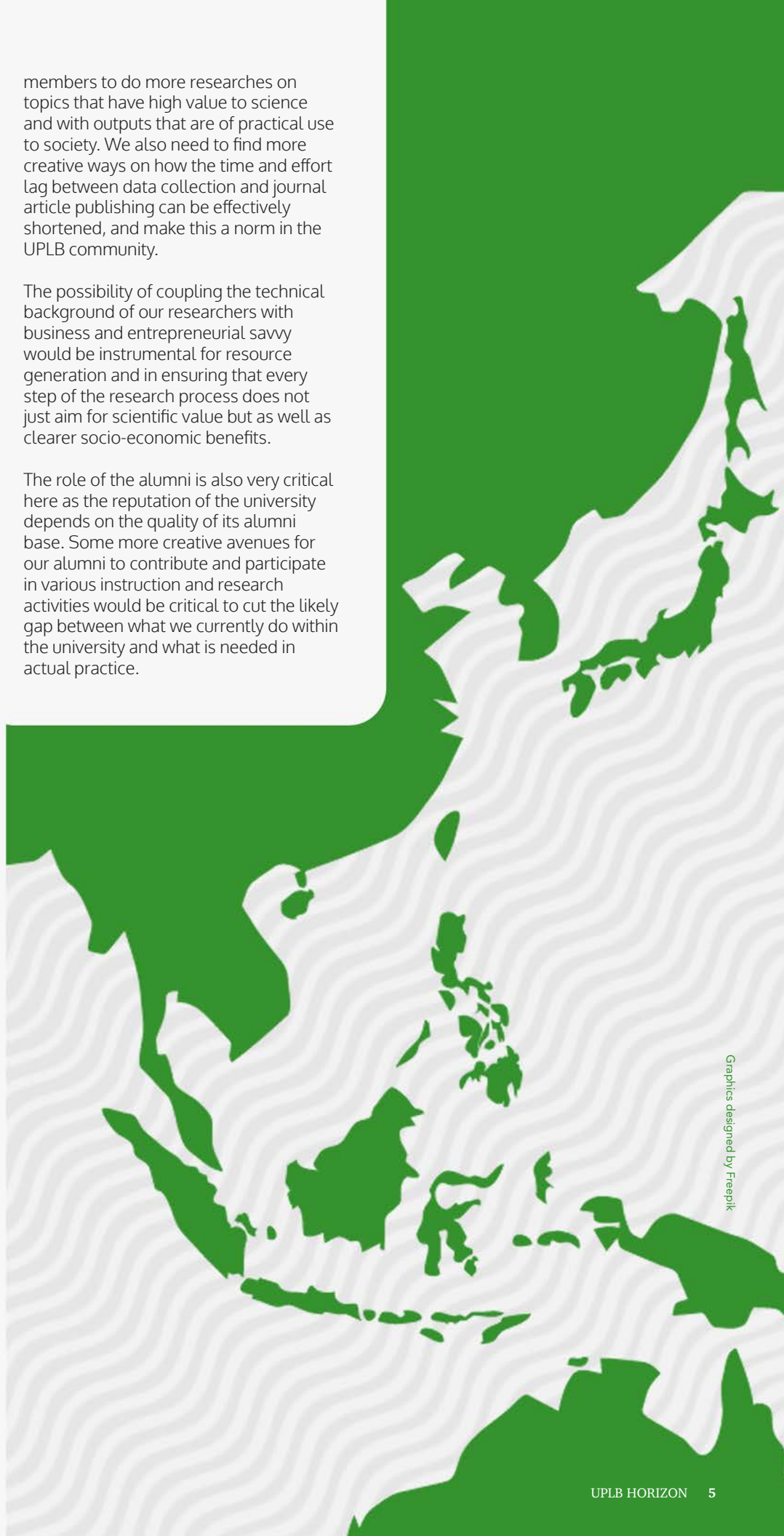
Graphics designed by Freepik

The role of the alumni is also very critical here as the reputation of the university depends on the quality of its alumni base. Some more creative avenues for our alumni to contribute and participate in various instruction and research activities would be critical to cut the likely gap between what we currently do within the university and what is needed in actual practice.