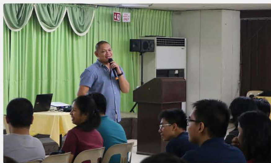
ORIENTATION PROGRAM ON STUDENT CONDUCT AND LEADERSHIP. Francis "Kiko" Faulve, ABS-CBN news reporter and UPLB alumnus discusses practical leadership to representatives of over 100 student organizations that attended "Student Organization Ultimate Leap (SOUL)," an orientation program conducted by the Office of Student Affairs (OSA) on September 4.