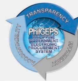
Philippine Government Electronic Procurement System (PHILGEPS)

Lampa attributed prompt and constant monitoring, strategic posting and uploading, and UP System-wide teamwork as among the factors that led to UPLB's top PhilGEPS ranking. Lampa is a member of a UP System task force dedicated to PhilGEPS-related activities. (Mark Jayson E. Gloria, with information from http://data/philgeps.gov.ph )