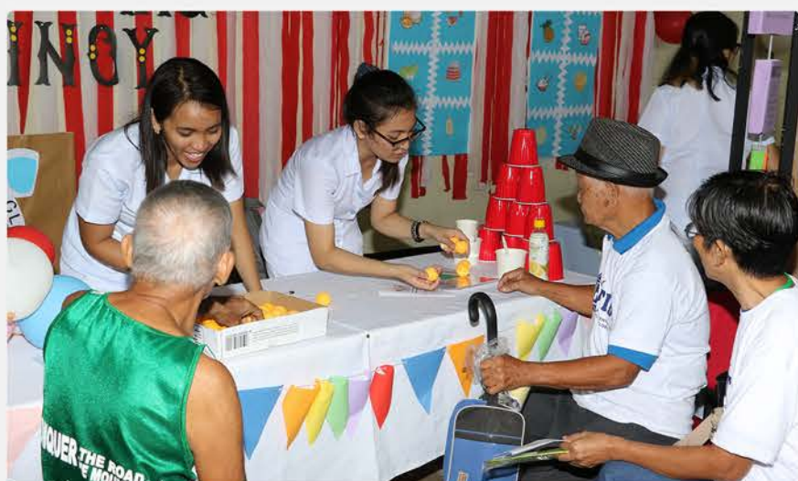
PROMOTING CARE FOR THE ELDERLY. BS Nutrition students assist participants in the 6th Senior Citizens Summit on Sept. 23 at Baker Hall. The summit, whose central theme was neurobics or brain exercises, is an activity of the Elderly Development Program of the College of Human Ecology.