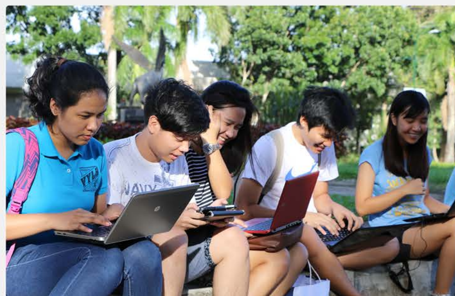
WIRELESS INTERNET CONNECTION. Students enjoy the improved amenities at one of the WiFi hotspots in the campus.