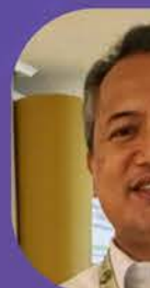
ROEHLAN BS (Economi Public